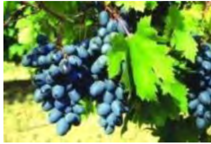
Grapes (Kilis Karası)

Traditional culture reflecting regional meals are highly impressive with their tastes and appearances. Kebab sorts, unique to Kilis, are served freshly with special spices. Kilis Karası (Kilis Grapes), Kilis Tava, and Kilis Katmeri (A kind of desert) are the foods that you should definitely taste before leaving Kilis.